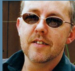
Jeremy Webb is the author of Basics Creative Photography: Design Principles (see page 40). He is a photographer and tutor with over 25 years' experience.

AVA titles have been very successful and widely adopted. What do you think are the factors that make our titles stand out?